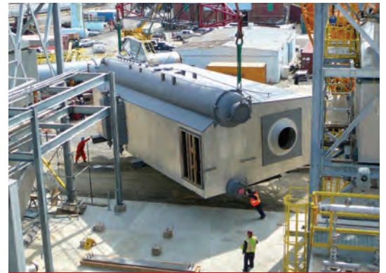
250,000 lb/hr 725 psig superheated boiler system.