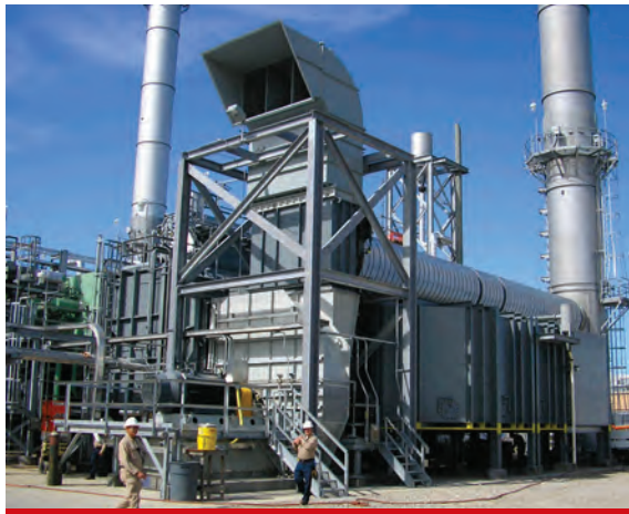
474,000 lb/hr 900 psig superheated boiler system.